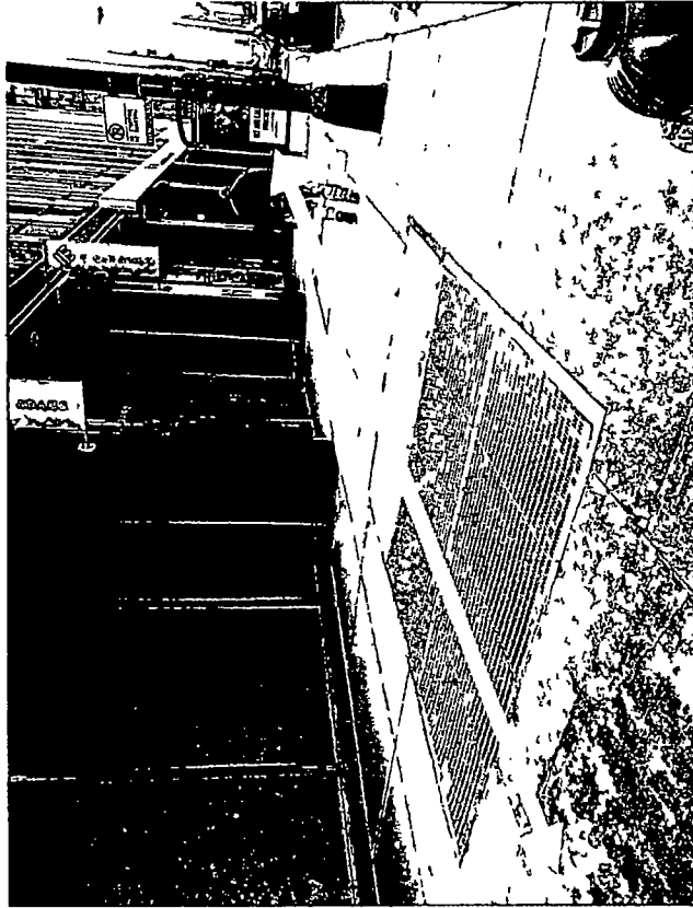
Adams Street Vault 112”L x 12”W