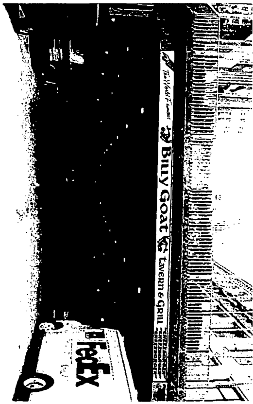
EAST ELEVATION - HUBBARD & MICHIGAN AVE.

○ BKGD = PANAFLEX BANNER MAT'L. COPY & GRAPHICS = 220-63 GERANIUM RED & BLACK VINYL