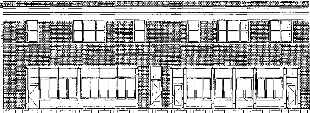
② East Elevation 3/32" = 1'-0"