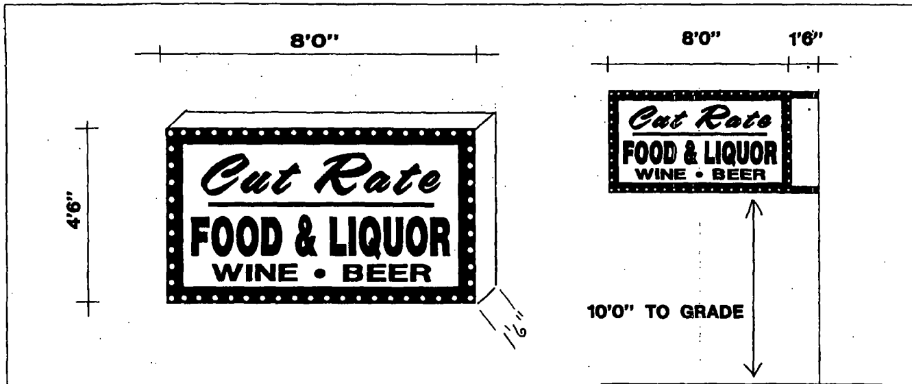
4'6"x8' PROJECTING SIGN