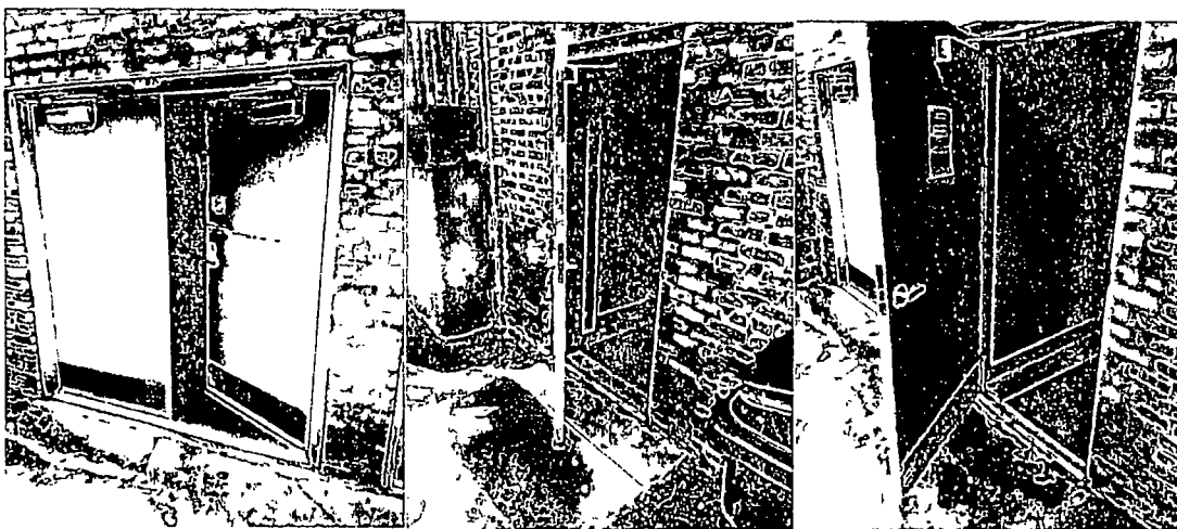
North Alley Door