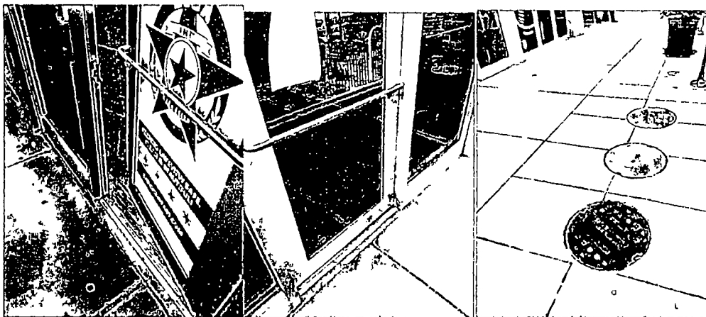
South Retail Space