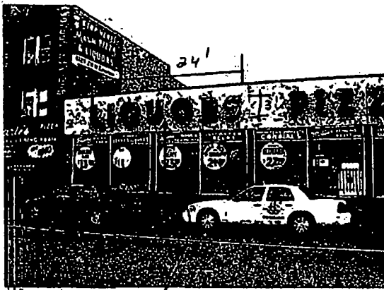
11' to grade