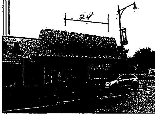
11' to grade