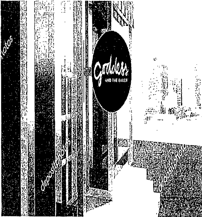
BLADE SIGN DAY VIEW