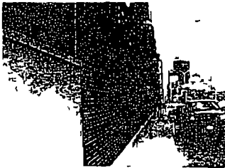
SIGN WALL LIGHT