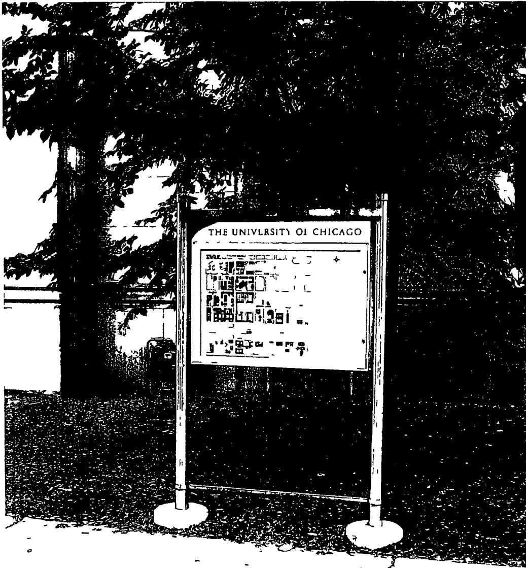
5550 South University Avenue Dimensions 4' 0" X 6' 0" X 0' 3"