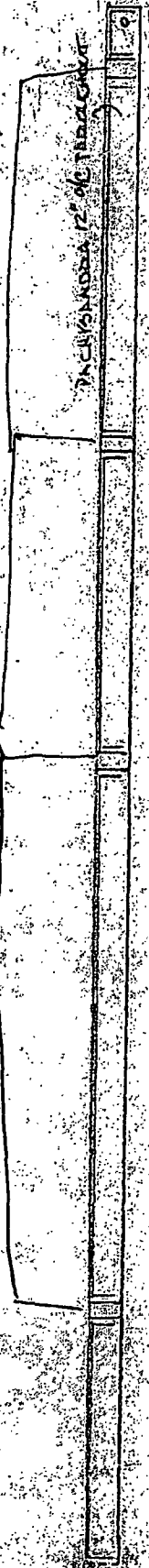
PARKWAY SCALE: 1" = 20' N →