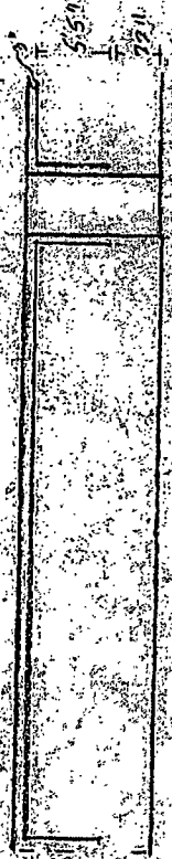
PARKWAY DETAIL SCALE: 1" = 10'