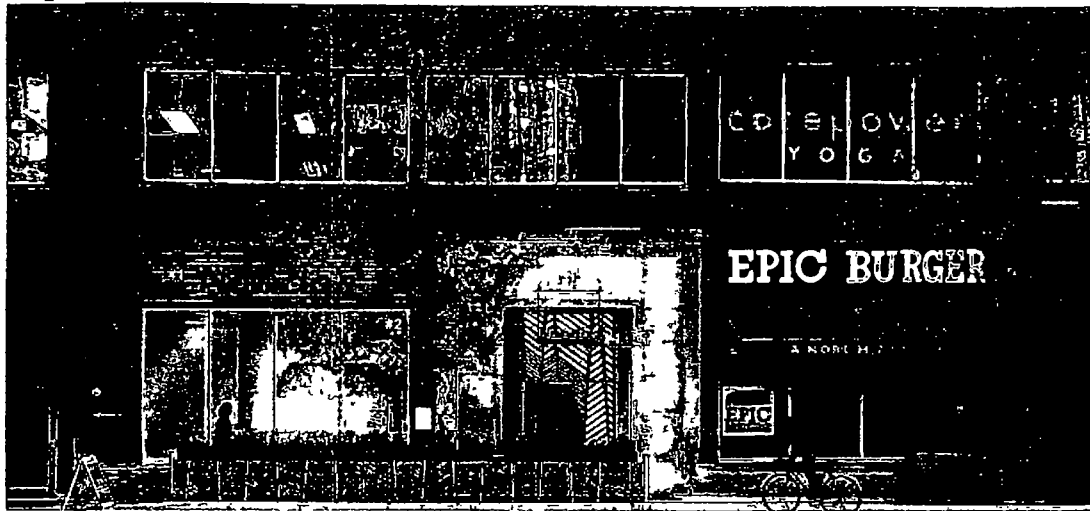
Exterior North Facing Facade Elevation SCALE 3/16 = 1'-0"

Submit finish samples for all signage for approval by Architect prior to fabrication Submit shop drawings for architect's review and approval