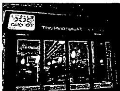
Existing Awning Structure

Existing Structure Awning Frame Change Fabric and Logo ONLY Awning color: R256,G226,B74 Logo Font color: BLACK