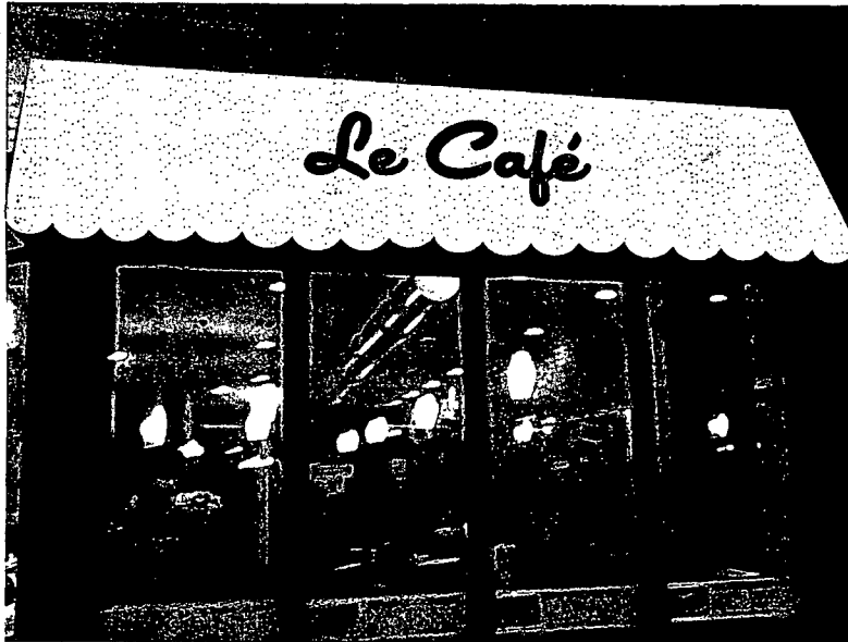
Store Front Elevation