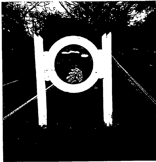
DEVON AND KOSTNER 5/9/11 LOOKING EAST