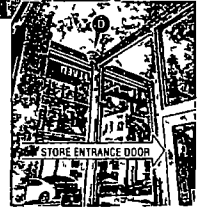
THIRD CAMERA (ONE OF THREE (ITEM D)) LOC. ABOVE STORE ENTRANCE AS SHOWN

State St. D/F Proj Blade Sign ONE 5' 0" HIGH x 4' 0" WIDE x 8' 6" PROJECTION (14' 0" CLEARANCE TO BOTTM FROM GRADE)