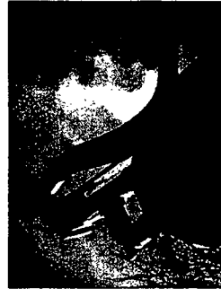
PHOTO REFERENCES MAY NOT REPRODUCE EXACTLY REFER TO SPECIFIED DIMENSIONS FOR CORRECT MEAS.

COLOR PRINTS MAY NOT ACCURATELY REPRESENT SPECIFIED COLORS. FOR ACCURATE COLOR ASSESSMENT REFER TO COLOR SPECIFICATIONS AND UTILIZE STANDARD VINYL AND PANTONE COLOR CHARTS.