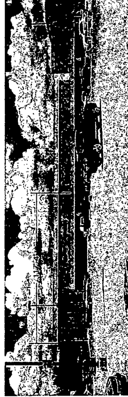
Render - N.T.S.