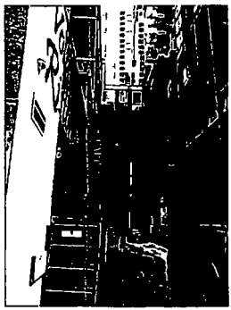
Signage in Ally