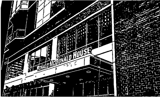
Proof of Signage REMOVED in front