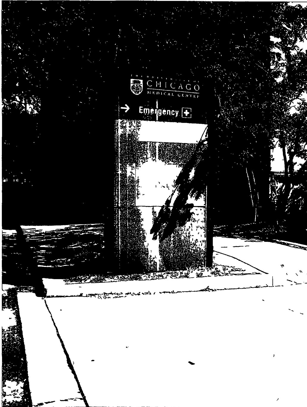
East 58 th Street and South Drexel Avenue Sign Dimensions 5' 9" X 10' 6" X 0' 9"