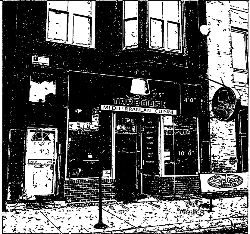
NOTE: Photo for representational purposes only. Signs are not to scale and may appear larger or smaller than shown.