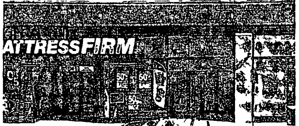
SOUTHWEST ELEVATION AS IS SCALE 1/8" = 1'-0"