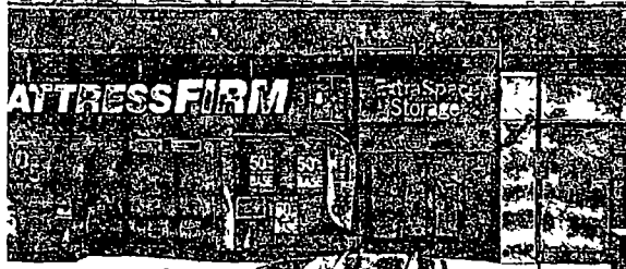
B SOUTHWEST ELEVATION WITH NEW CHANNEL LETTER SET ON RACEWAYS SCALE 1/8" = 1'-0"