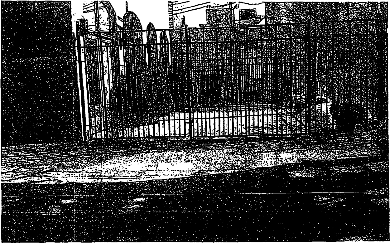
19 East 21st Street Alley /Patio at rear of building