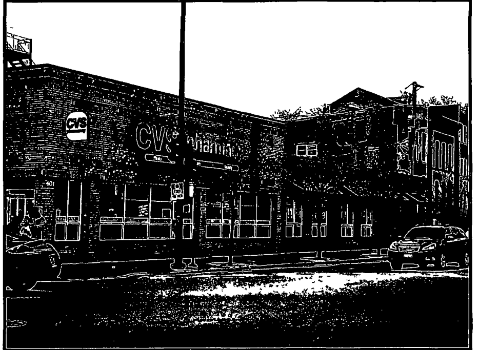
Proposed Signage - Elevation