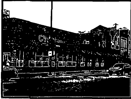
Existing Signage - Elevation