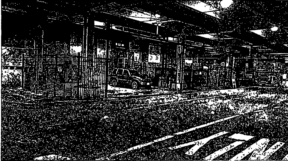
VIEW OF LOWER MICHIGAN