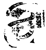
NuGold Satin Titanium Stainless Steel Alloy 304

1. Lead 2. Deep Inertial Rolled Channel Letter Face Back Raceway Alum. Co. 3. 4. 5. 6. 7. 8. 9. 10. 11. 12. 13. 14. 15. 16. 17. 18. 19. 20. 21. 22. 23. 24. 25. 26. 27. 28. 29. 30. 31. 32. 33. 34. 35. 36. 37. 38. 39. 40. 41. 42. 43. 44. 45. 46. 47. 48. 49. 50. 51. 52. 53. 54. 55. 56. 57. 58. 59. 60. 61. 62. 63. 64. 65. 66. 67. 68. 69. 70. 71. 72. 73. 74. 75. 76. 77. 78. 79. 80. 81. 82. 83. 84. 85. 86. 87. 88. 89. 90. 91. 92. 93. 94. 95. 96. 97. 98. 99. 100.