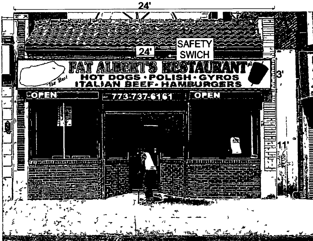
*ELECTRIC SIGN 3FT X 24FT