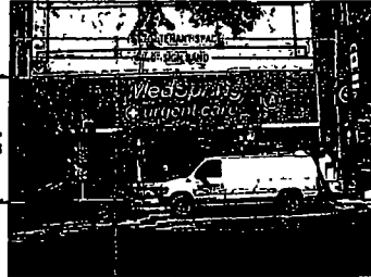
SCALE 1/16" = 1'0"