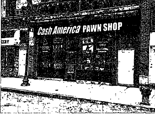
1 WEST ELEV. (PHOTO) SCALE: 1/8" = 1'-0"