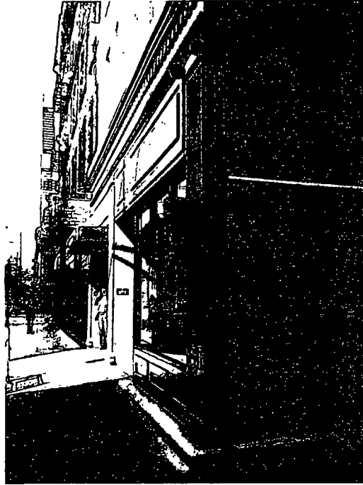
Red spots indicate where lighting will be installed