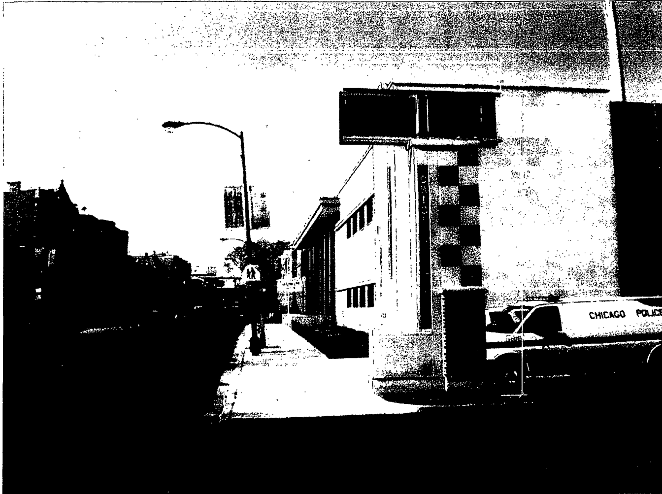
SIGN ELEVATION SCALE: N.T.S.