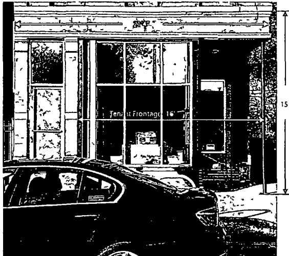
Store front without signage