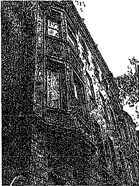
West bay window at 424 W. Belden