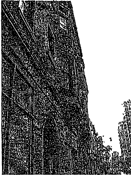
Bay windows at 2304 & 2308 N. Clark