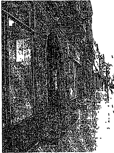
Bay Windows 2304 & 2308 N. Clark