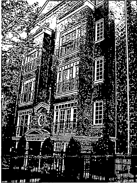
Front of the building