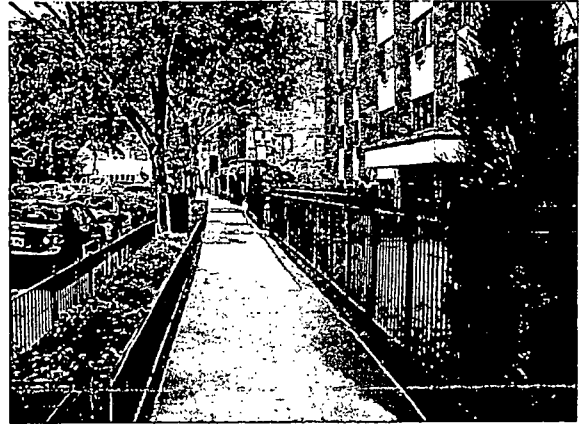
Sidewalk looking east to Clark street