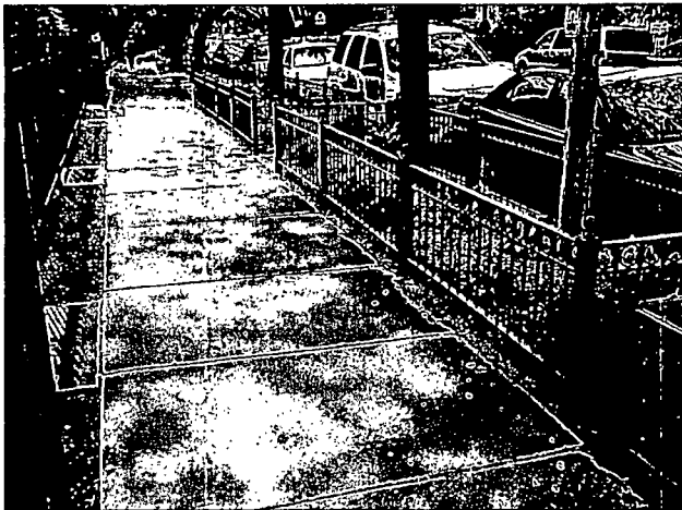
Wrightwood Plaza parkway fences