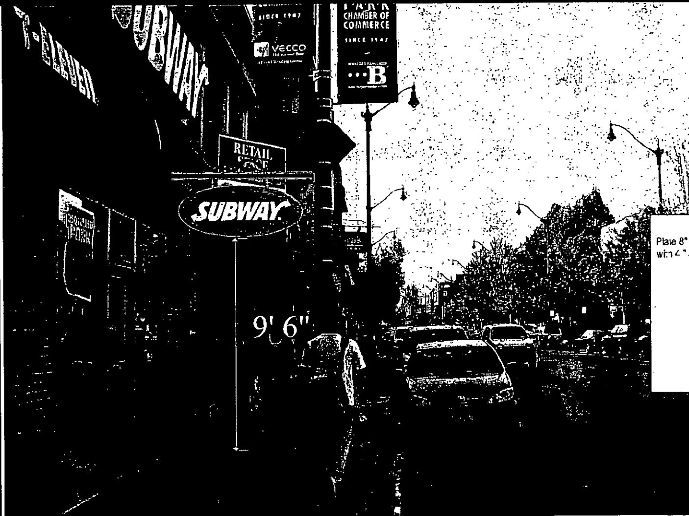
Plate 8" X 8" X 1/4" w/ 1/4" Square Tube