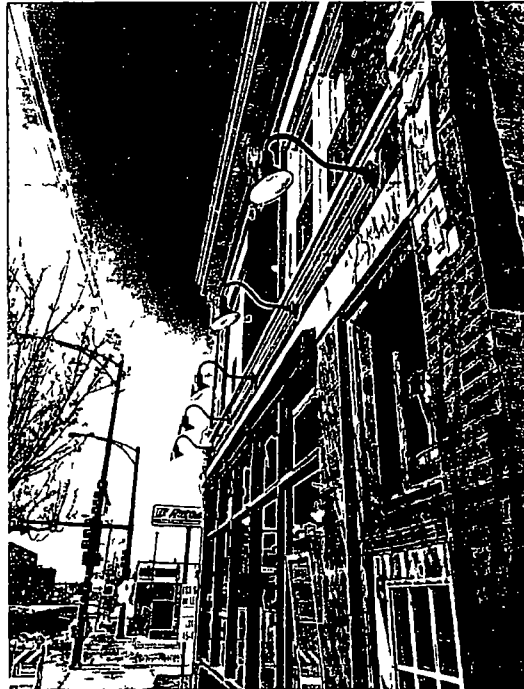
View looking South to North without awning