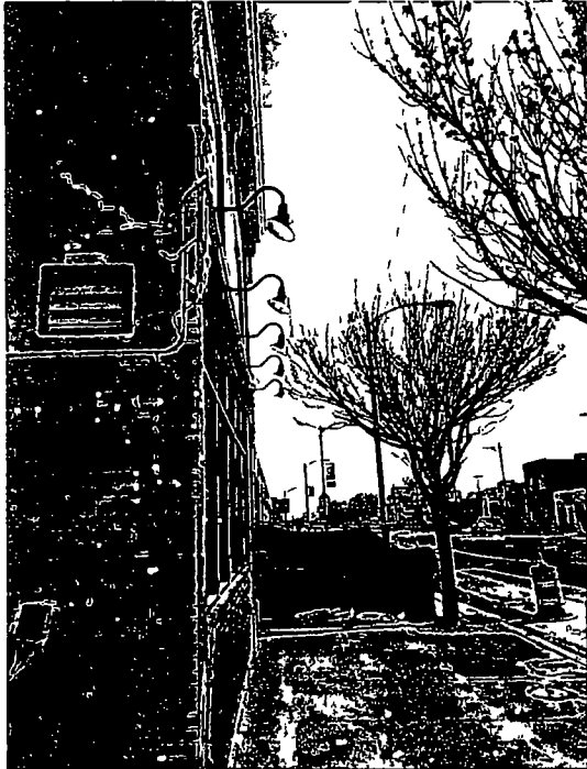
View looking North to South without awning