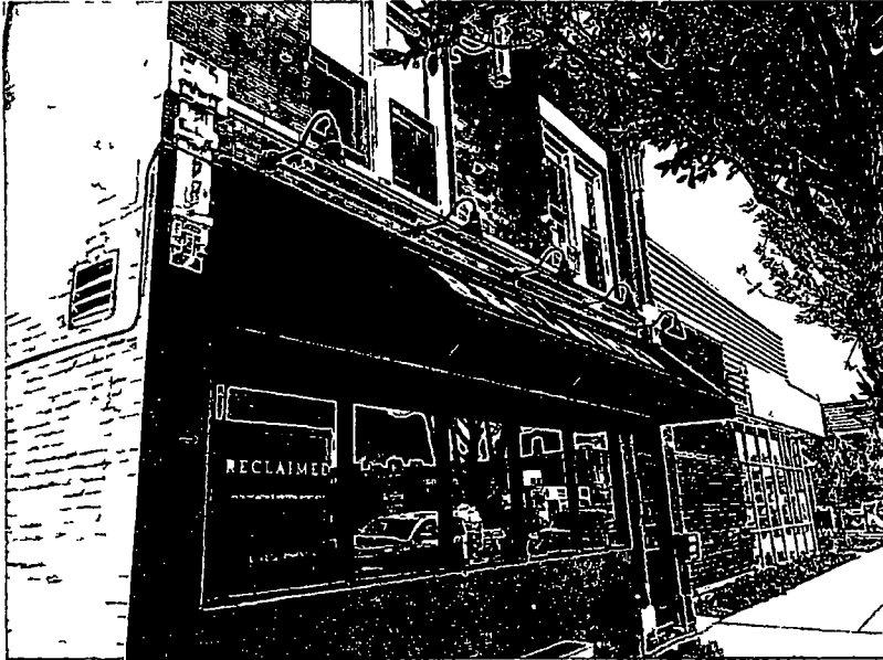
Lights over the awning