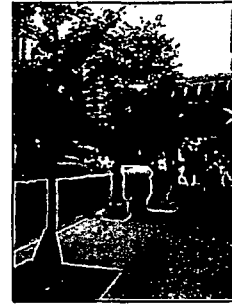
VIEW OF PUBLIC RIGHT OF WAY ALONG RUSH STREET