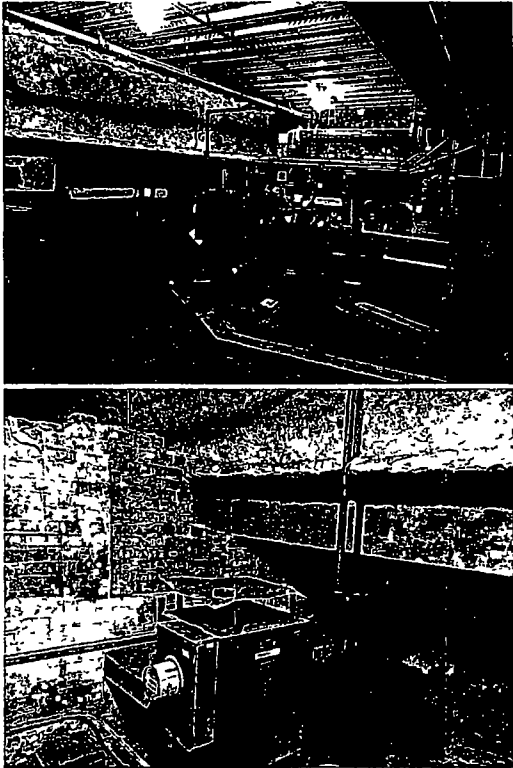
PHOTOS OF EXISTING VAULT