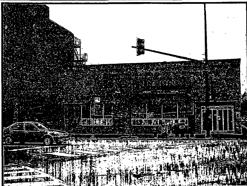
Proposed Signage - Elevation