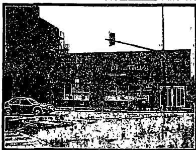
Existing Signage - Elevation