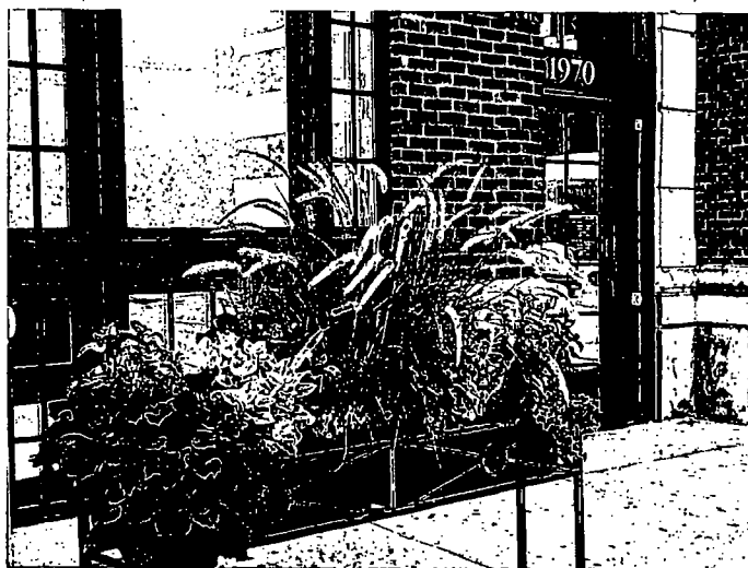
1970 N HALSTED