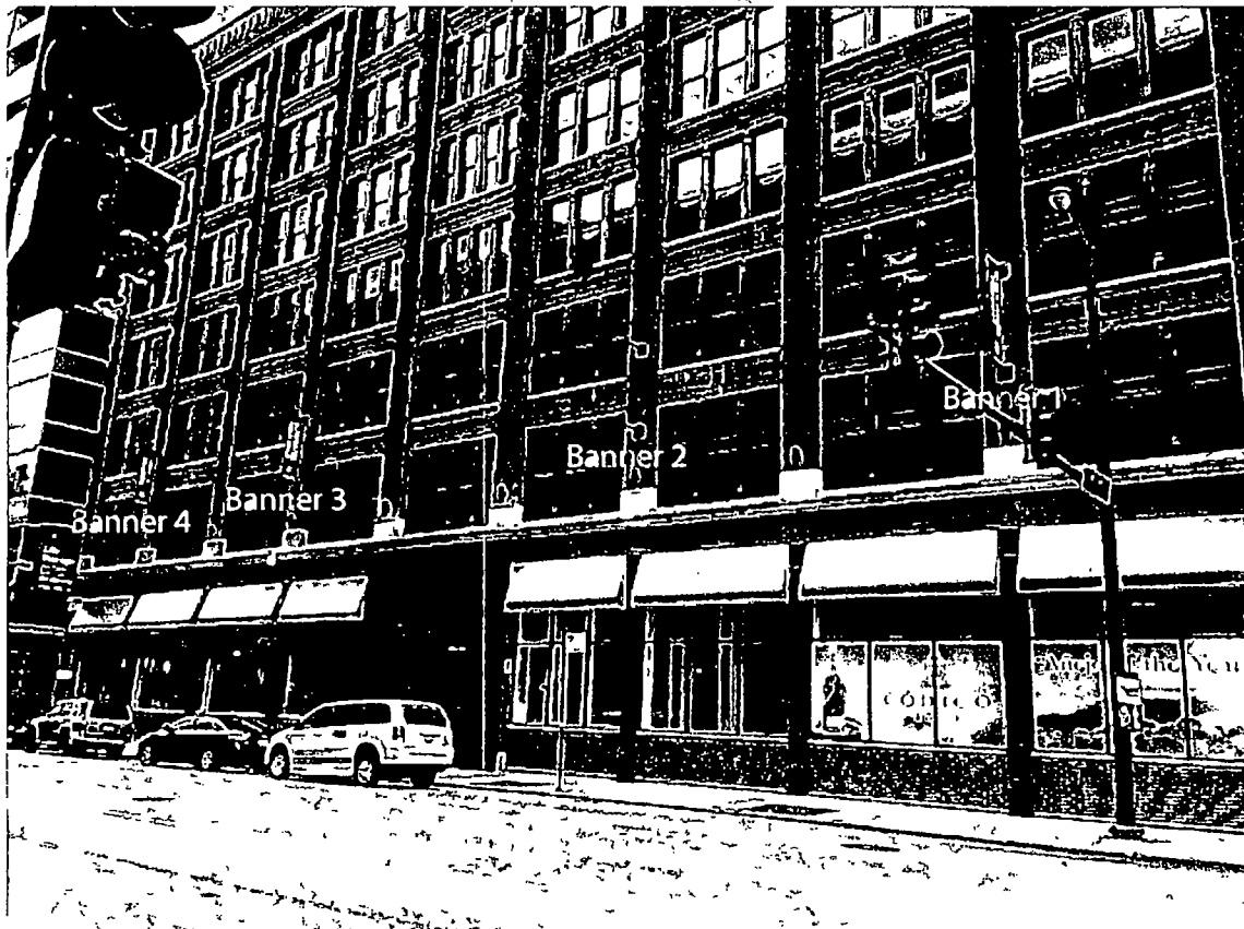
Orleans Street - 4 Banners