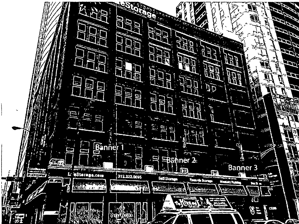
Orleans Street - 3 Banners