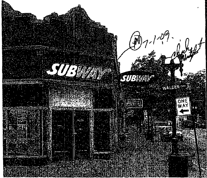
EXHIBIT D PAGE 1 of 4

STRICTLY NEON, INC. 4608 W. 137TH ST. CRESTWOOD, IL 60445 (708)597-1616 (708)597-8638 FAX