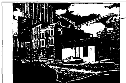
Looking west at 162 W Grand Avenue