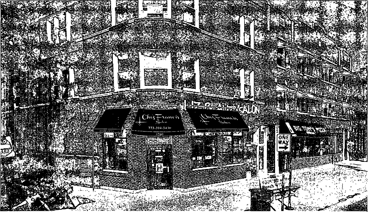
Project: Beauty Salon Awning Client: Johnner Date: 7/1/14 Location: 3280 W Fullerton Chicago, IL Material: BLACK VINYL AWNING w/ WHITE VINYL LETTERING Graphics: Approved By Client As Shown In Proof