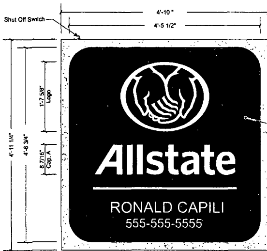
ALSTWS2_25 - WALL SIGN SCALE: 1" = 1'-0"

ENGINEERING SHOP VINYL / LAYOUT ROUTING / KNIFE