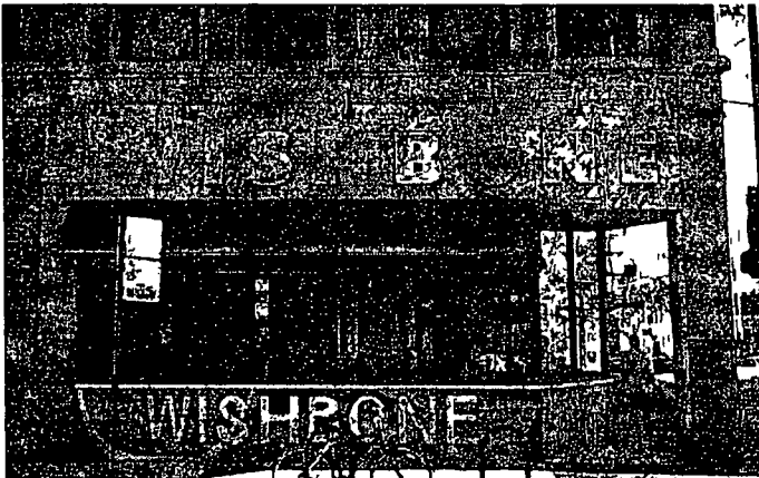
8 Goose neck 1 LAMPS on School Street 183' length, 183' width and 14.5' above grade