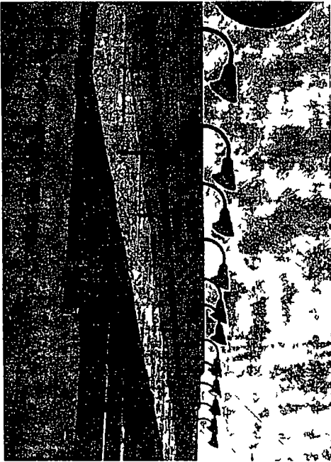
12 Goose neck 1 LAMPS on Lincoln Ave 183' length 183' width and 14.5' above grade