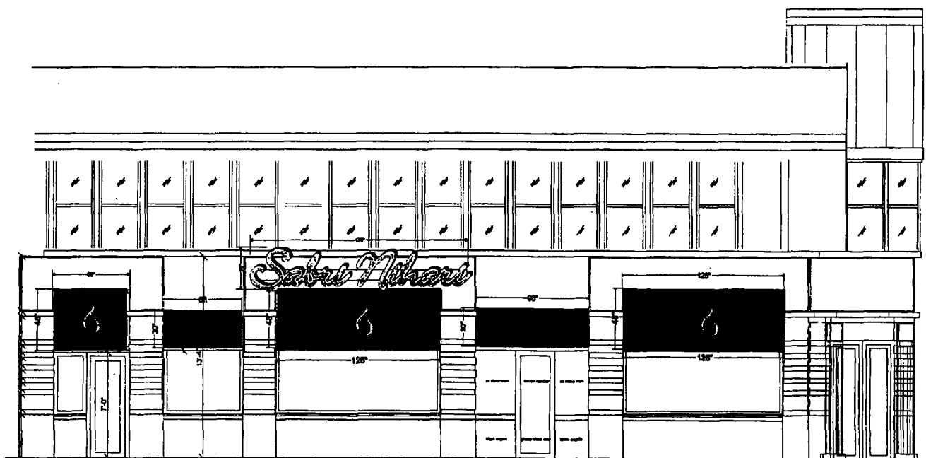
ELEVATION ON DEVON AVENUE

EXPRESS SIGNS & Graphics Inc. Wholesale Sales & Retail Services / Express Signage www.neonexpress.net 1-888-2NEONEX 5028 N. Broadway, Chicago, IL 60640