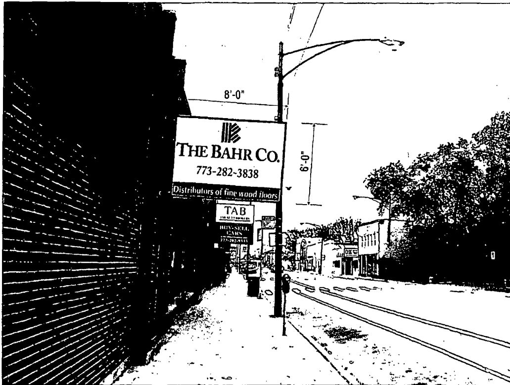
(1) D/F ILLUMINATED SIGN