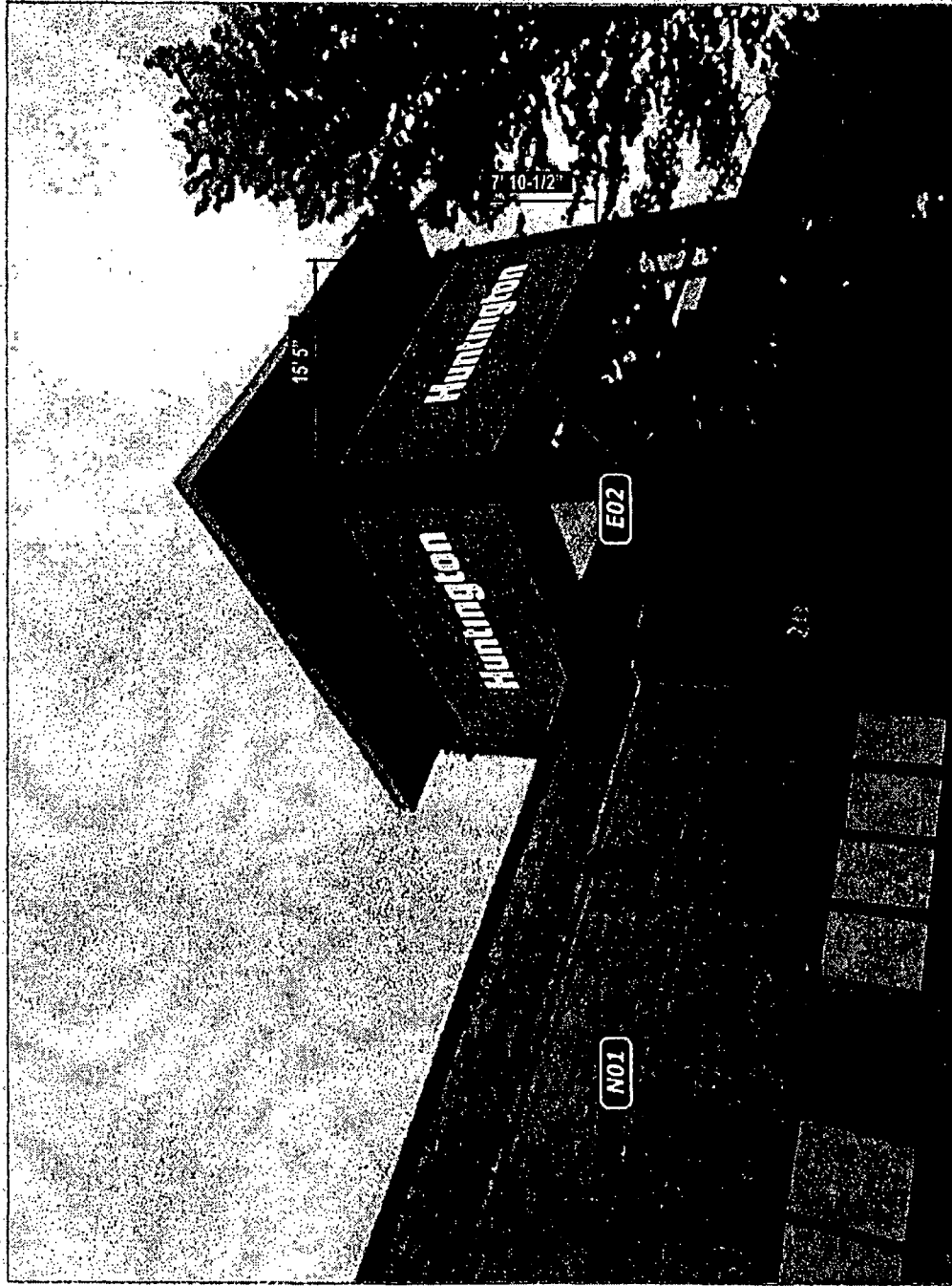
Signs Rendered Proportional to the Photo