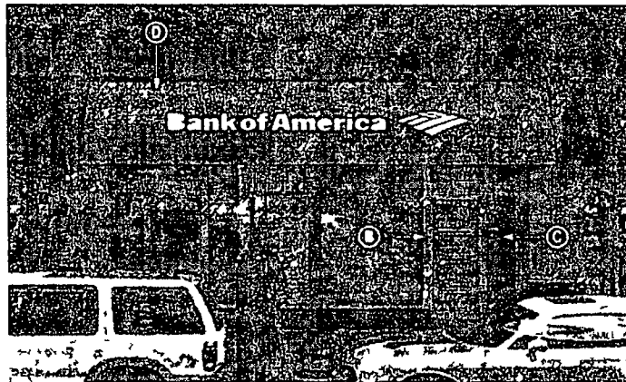
PHOTOGRAPH OF THE BANK OF AMERICA BRANCH

AWNING SHALL BE PAINTED TO MATCH THE BANK OF AMERICA SIGNAGE