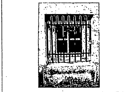
EXISTING WESTWARD WINDOW TO BLOWUP AIR UNIT (TYPICAL GARAGE)