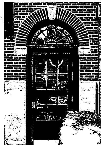
WEST ENTRANCE ARCH'D TRANSOM