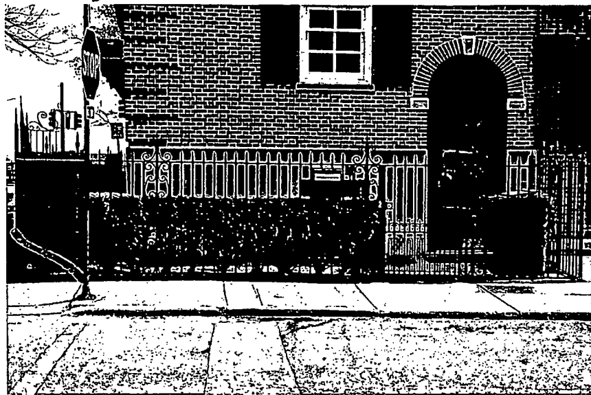
EXISTING WEST TERRACE SIDE AIR COOP