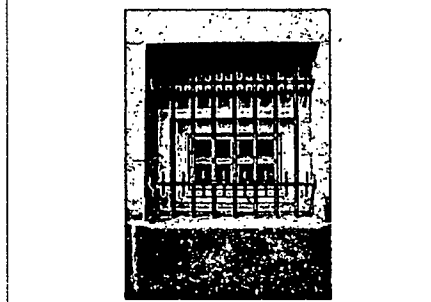
EXISTING WINDOW TO BLOWUP EXHAUST UNIT (FROM MECH. ROOM)