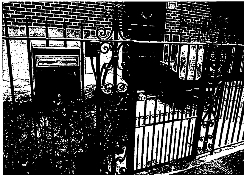
EXISTING WEST TERRACE SIDE DRIVE