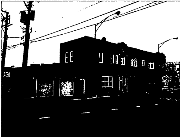
NORTHEAST ELEVATION (flower pots planted in summer months)